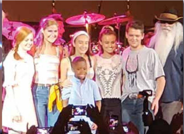
The Oak Ridge Boys brought some of the Shriner Hospitals for Children kids up on stage and sang Thank God for Kids.