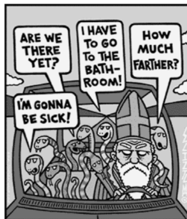
St. Patrick driving the snakes out of Ireland.

Speaking of St. Patrick's Day, we will be parading in Royal Oak on March 12, then in Detroit on March 13. Also, look for us hither and dither on St. Patrick's Day. Keep an eye out for us in your neighborhood!