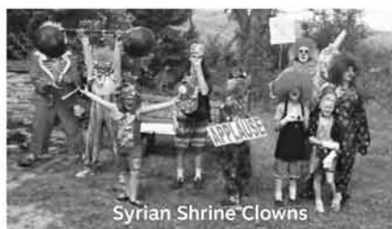
Syrian Shrine Clowns