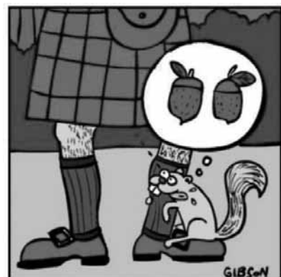
Chippy the squirrel moments before being bludgeoned to death by a set of bagpipes.

We would encourage all who recently went through the spring ceremonial come down and see us on Tuesdays. Joining any unit is a good thing to do, but your rewards in heaven will be even greater if you join the Highlanders. We