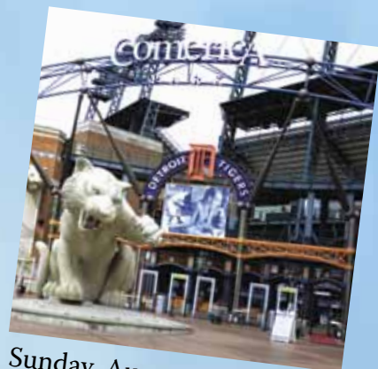
Sunday, August 20th - Shriners Day at Comerica Park