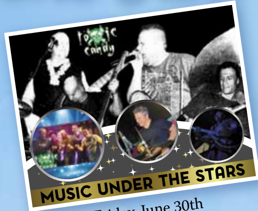
Friday, June 30th