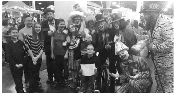
A VIP Shrine patient goes to Chicago enjoying a day at the Circus.