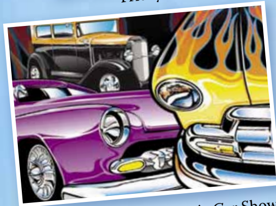
Saturday, July 29th - Classic Car Show