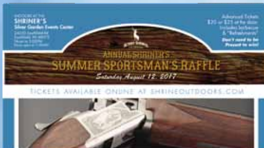
Summer Sportman's Raffle - Saturday, August 12th