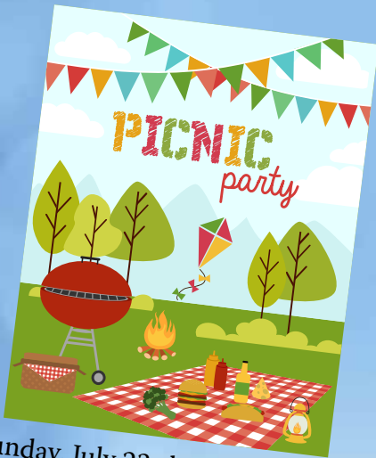
Sunday, July 23rd - Family Picnic