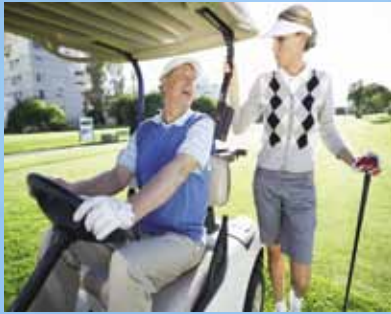
Saturday, June 24th - Golf Outing