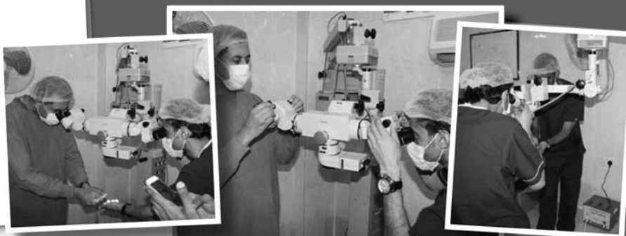
Photos of training on the use of the microscope at Khartoum Teaching Dental Hospital.