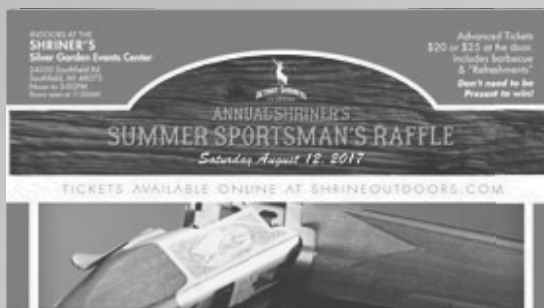
Summer Sportman's Raffle - Saturday, August 12th