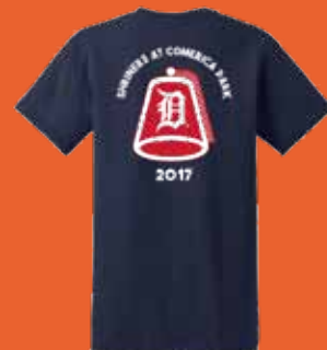
Back of T-Shirt