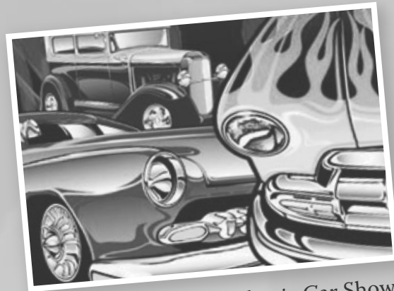
Saturday, July 29th - Classic Car Show