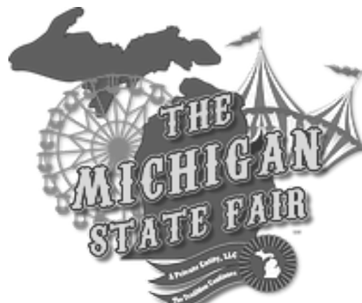
Detroit Shrine Circus/Michigan State Fair - August 31st–September 4th