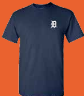
Front of T-Shirt

Please Give the T-Shirt Sizes for Your Group!!