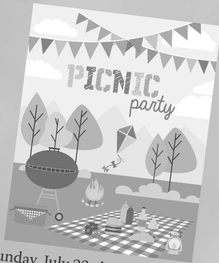
Sunday, July 23rd - Family Picnic